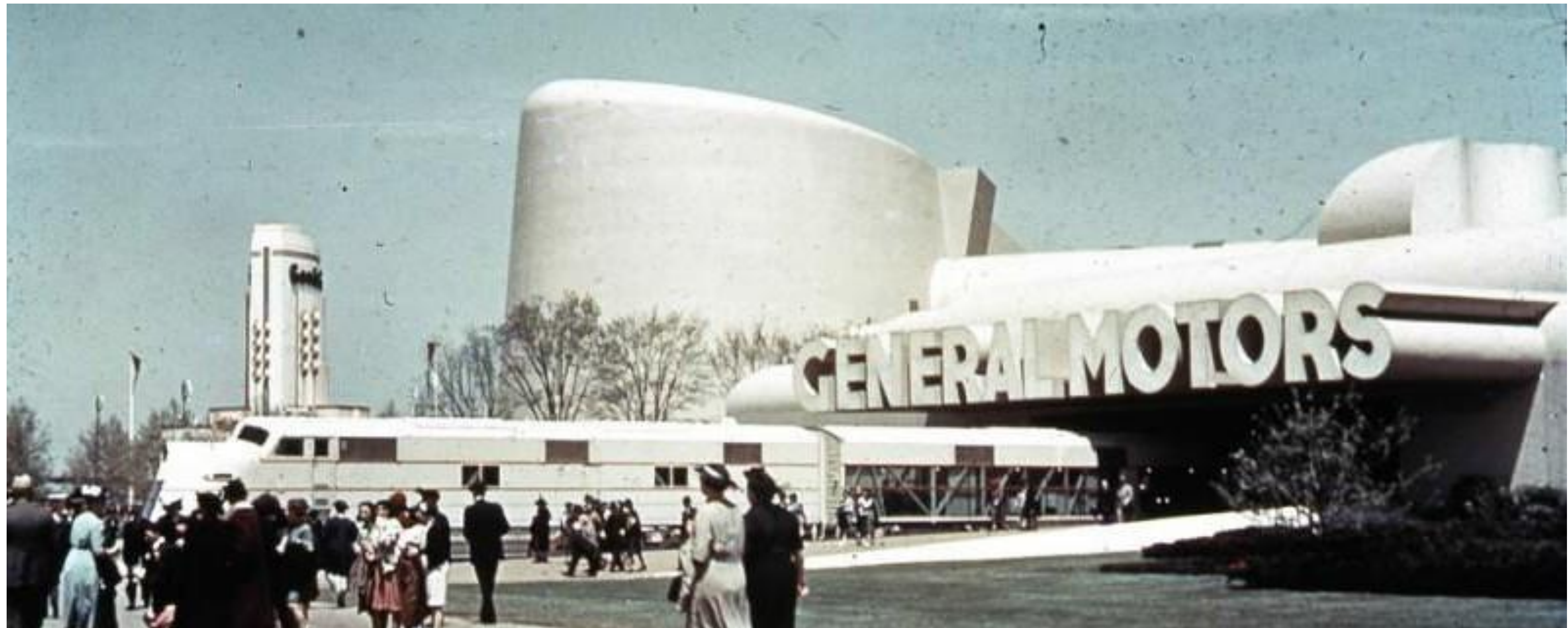
General Motors Futurama Pavillion 1939-1940

BUILDING SMART CITIES BEGINS WITH TRANSPORTATION INFRASTRUCTURE TO REDUCE CONGESTION AND ENERGY CONSUMPTION